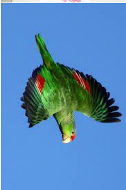
96870 Jefferson Cutrim Rocha